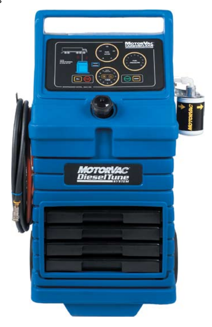
Part No. 500-4000P