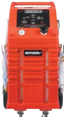
The TransTech service kit is specifically formulated to be used with the TransTech system!